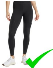
Bike shorts/leggings without shorts over the top