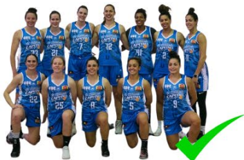
All team members matching