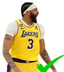
Compression under playing jersey with all team in the same colour