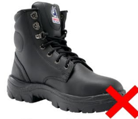
Non sport/gym shoes (shoes with marking soles)