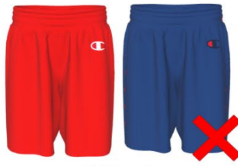
Different coloured shorts