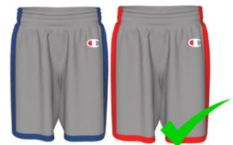
Same base colour but different trim