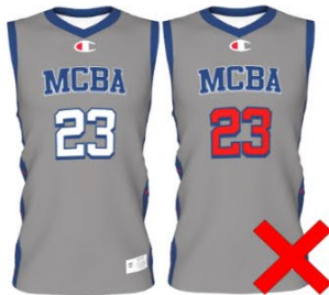
Same base colour but different coloured numbers