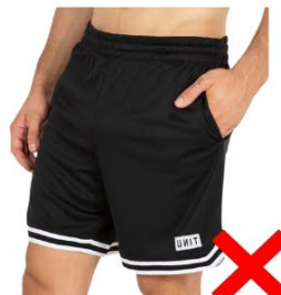
Shorts/pants/leggings with pockets