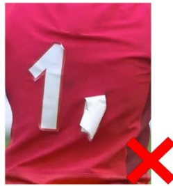
Damaged or missing numbers