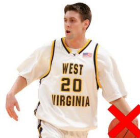
Loose fitting T-shirts under jersey