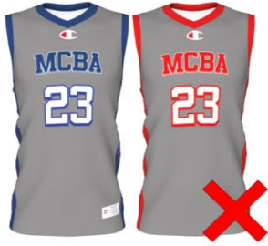
Same base colour but different trim